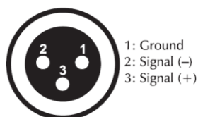
DMX-output XLR mounting-socket: