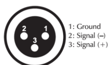
DMX-output XLR mounting-socket: